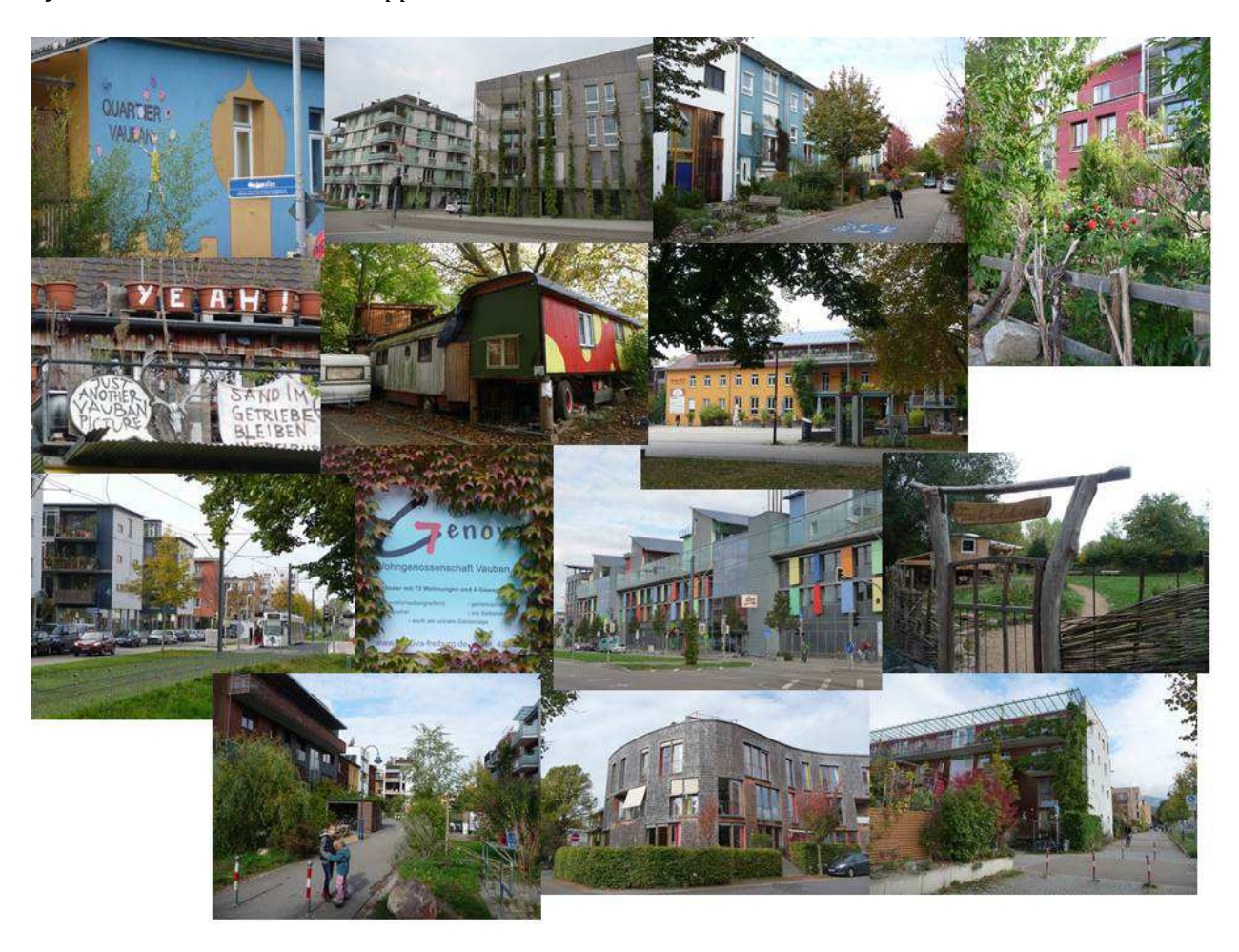
Figure 5.1: Impressions from Vauban: In the middle, the yellow district center ,Haus 37'